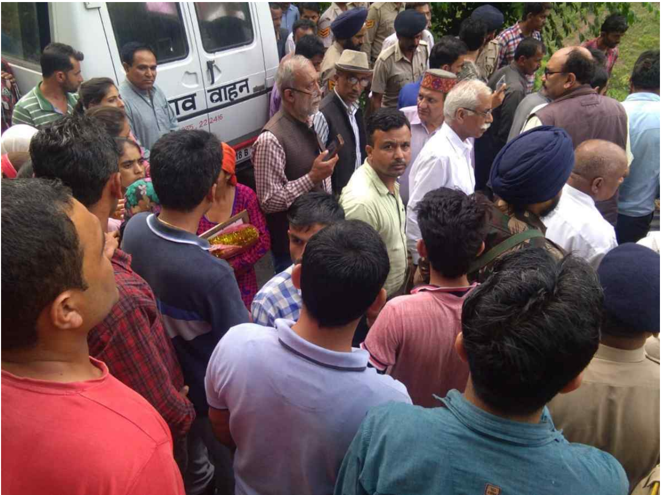
People crowd at the funeral of slain RTI activist.